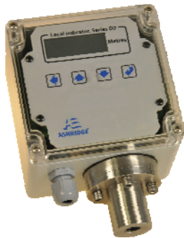
9100 D2 Display Option